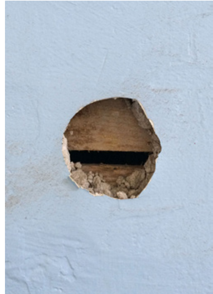
Melanie Upton Historical Marker (rupture 3) , 2014