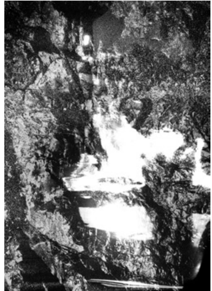
Jon Butt Nebula , 2013