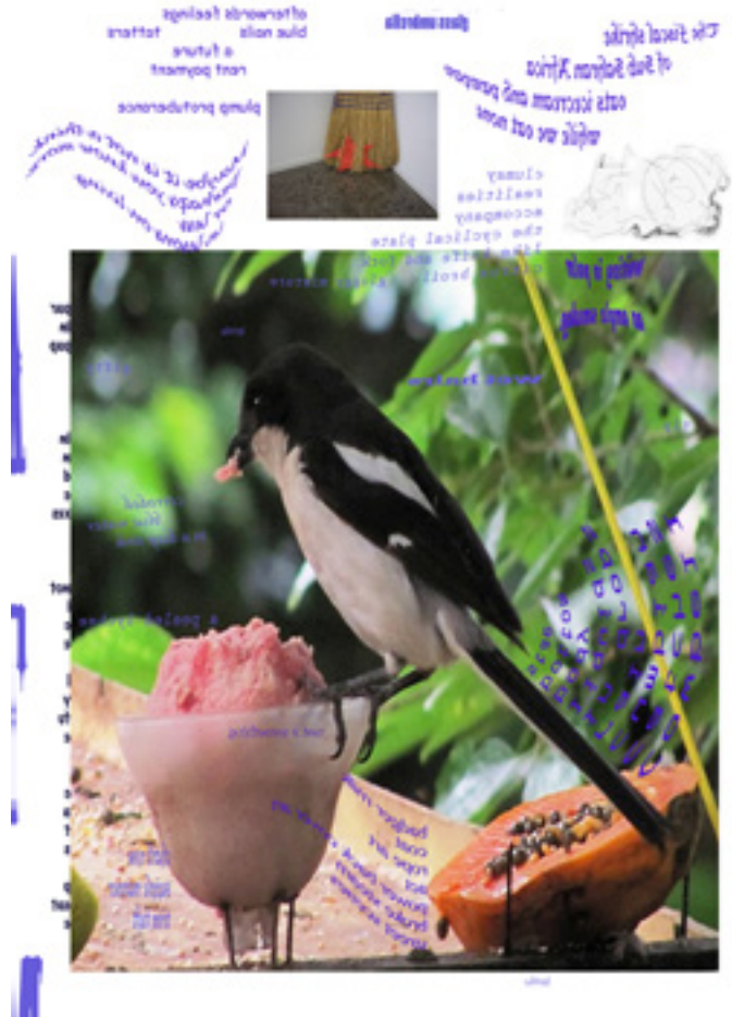
Christopher L G Hill A Nu word order is pozible , 2015