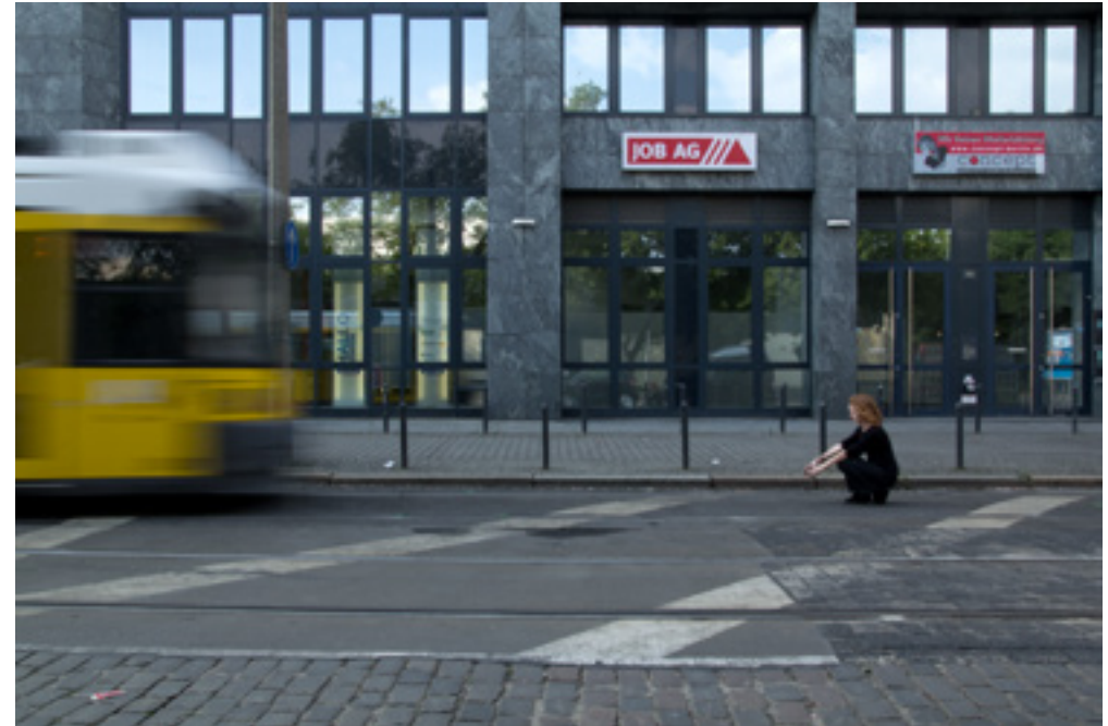
Melanie Irwin Terminus Loop (Warschauer Str.), 2013