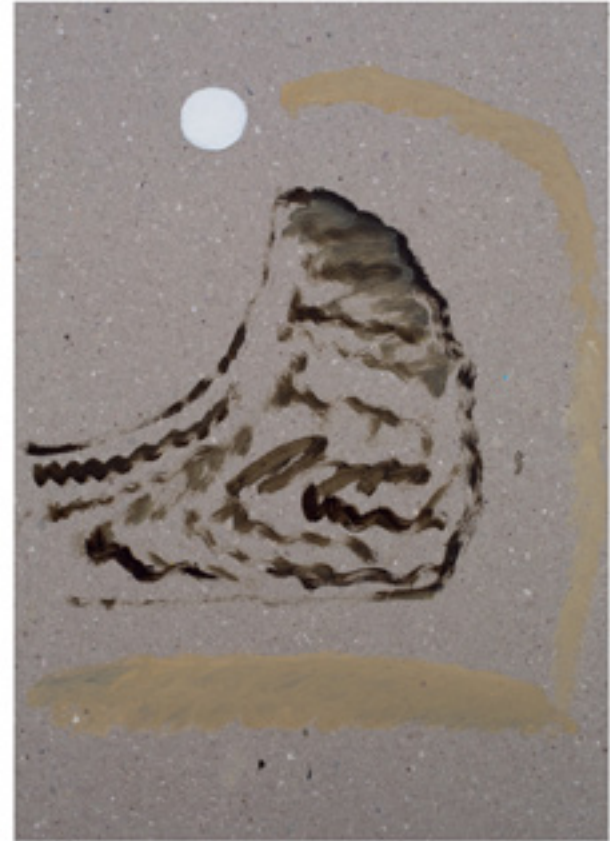
Eleanor Louise Butt High on the Limestone Cliffs , 2015 Original image: oil on card